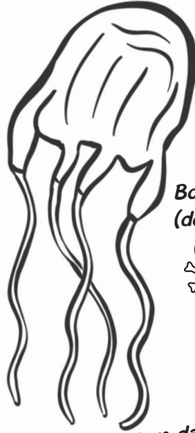
Box Jellyfish (deadly)