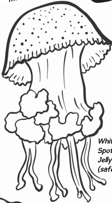
White Spotted Jellyfish (safe)