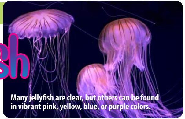
Many jellyfish are clear, but others can be found in vibrant pink, yellow, blue, or purple colors.

Because the jellyfish is equipped to protect itself, it doesn't have many predators. Only animals that aren't hurt by its sting can actually eat them; all the other sea creatures avoid contact. Even humans know that it's important to be very careful around them!