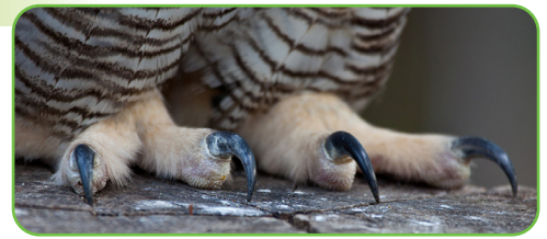
An owl's sharp talons help them catch their prey.