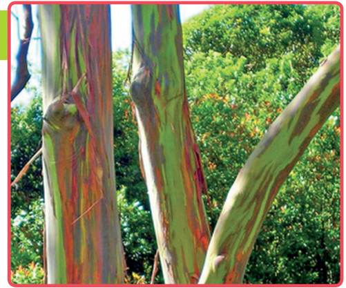
The Rainbow Eucalyptus trees like warm and humid climates. They are native to the Philippines, Papua New Guinea, and Indonesia. Some places like Hawaii and California use them as ornamental trees.

If you've ever had an art class, then you've probably worked with some kind of modeling clay. It comes in all kinds of colors, but sometimes it's fun to combine two colors together to make a different one. So imagine that you've chosen two colors and you slowly start mixing them together with your hands. Before they combine completely, the clay becomes streaked with those two colors. Now, stop mixing and use that clay to make something. Can't think of anything? Well, how about a tree?